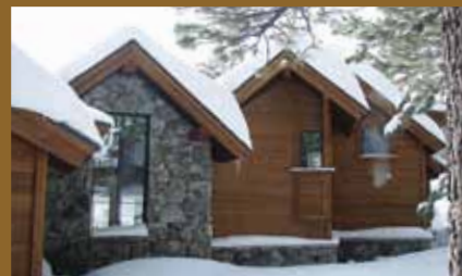
In the Mountains