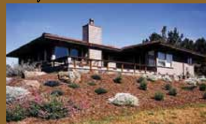
On the Coast